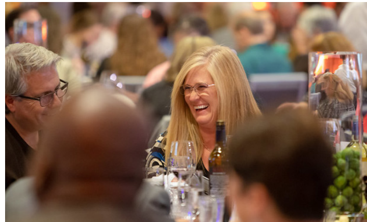
ABUNDANCE DINNER & AUCTION: Saturday, Oct. 24