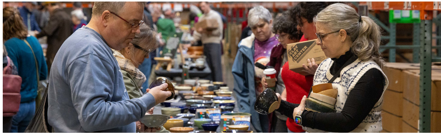
EMPTY BOWLS: Saturday, Dec. 5

Get more details about EFN events at efoodnet.org/events