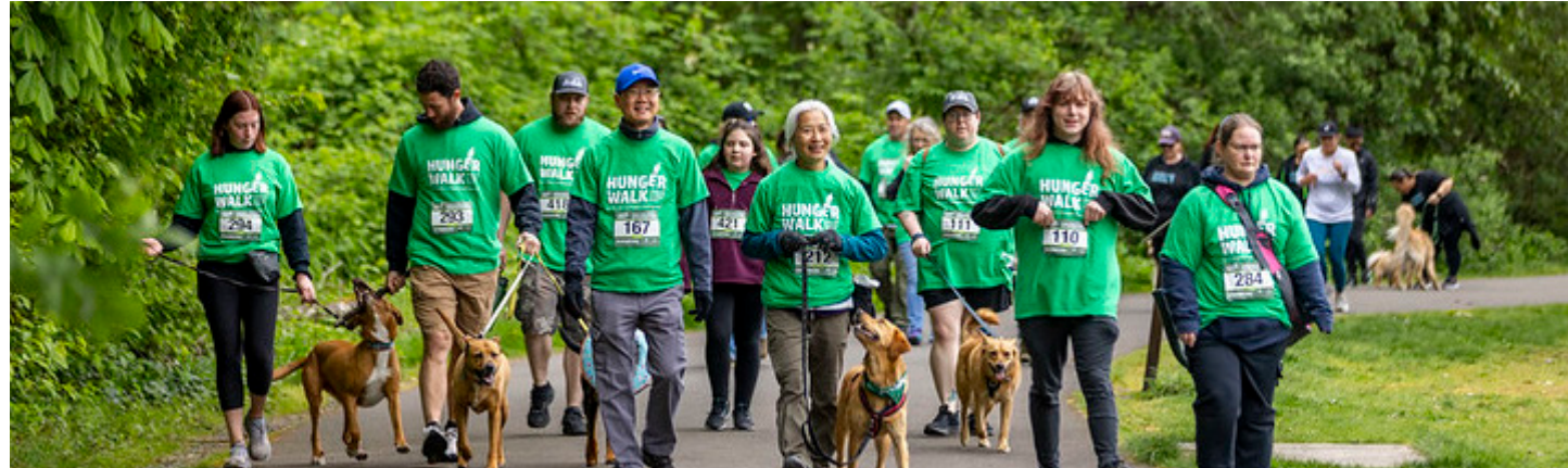
HUNGER AWARENESS MONTH: May 1-31 HUNGER WALK: Saturday, May 2