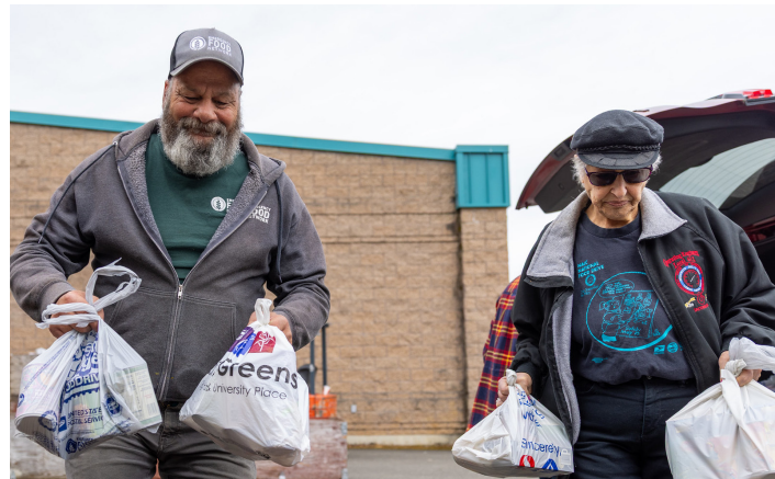
LETTER CARRIERS FOOD DRIVE: Saturday, May 9