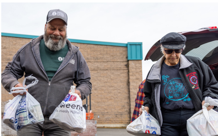
LETTER CARRIERS FOOD DRIVE: Saturday, May 9