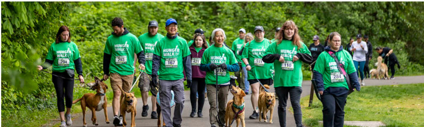
HUNGER AWARENESS MONTH: May 1-31