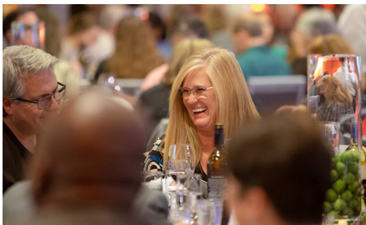
ABUNDANCE DINNER & AUCTION: Saturday, Oct. 24