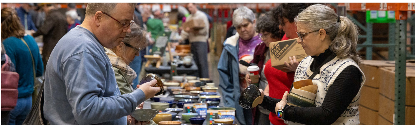
EMPTY BOWLS: Saturday, Dec. 5

Get more details about EFN events at efoodnet.org/events